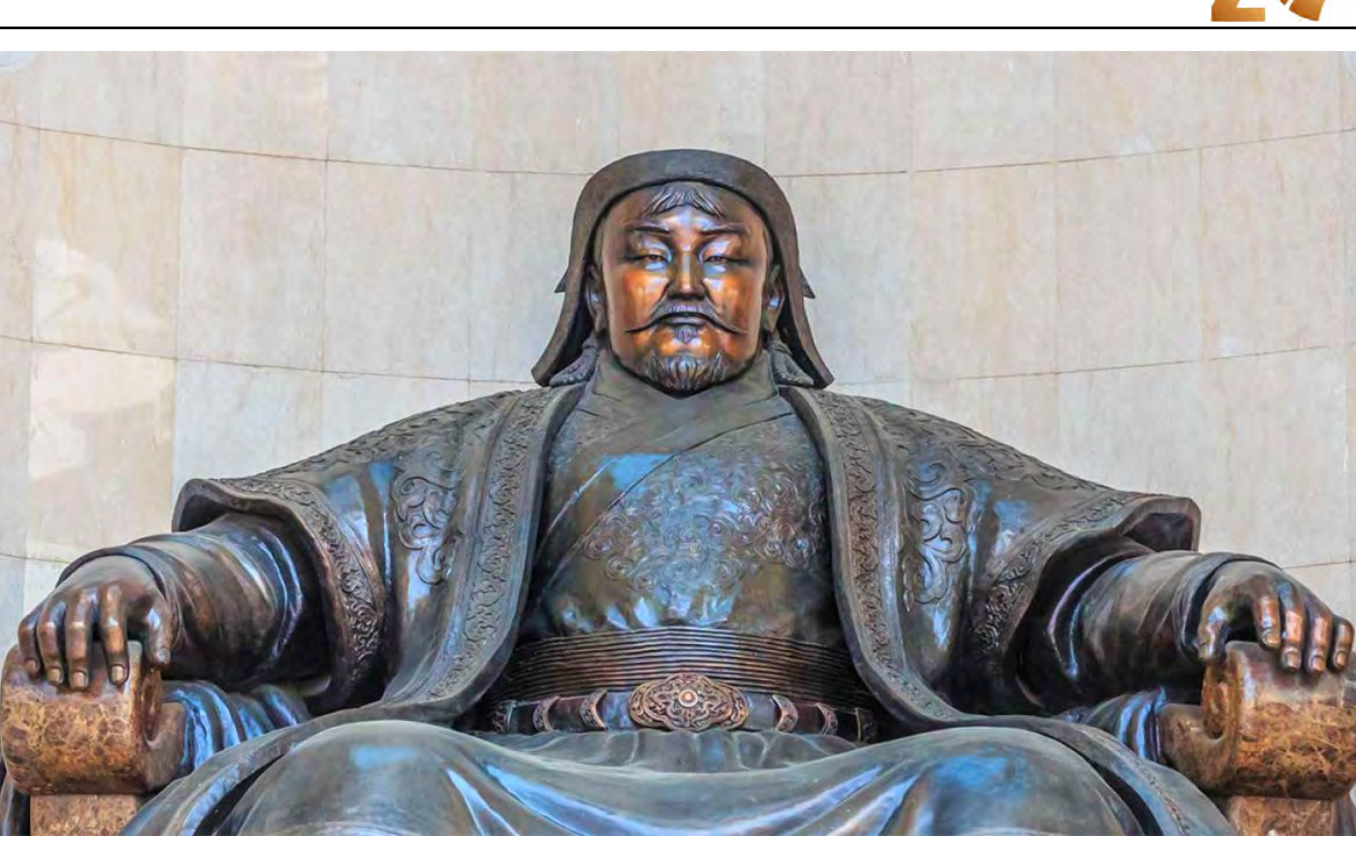
First of all, I would like to make it clear that a pony trek with Genghis Kahn isn't your bog standard, average, pony trekking holiday.

The organisers are very thorough and provide the ponies, tack, and all the trappings required for the trek: Yak horn bows (range 200 yards), lightweight leather armour complete with a densely woven silk undershirt, sword and lance, and that sort of thing. The silk undershirt is provided in case an arrow pierces the leather armour. "To enable the arrow to be easily twisted out", they say. A likely story that! And one, that, fortunately, I did not have the need to prove!