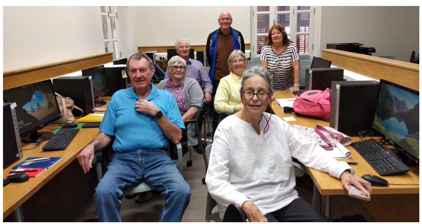
C3A members about to start their first training session in the use of the E-government services