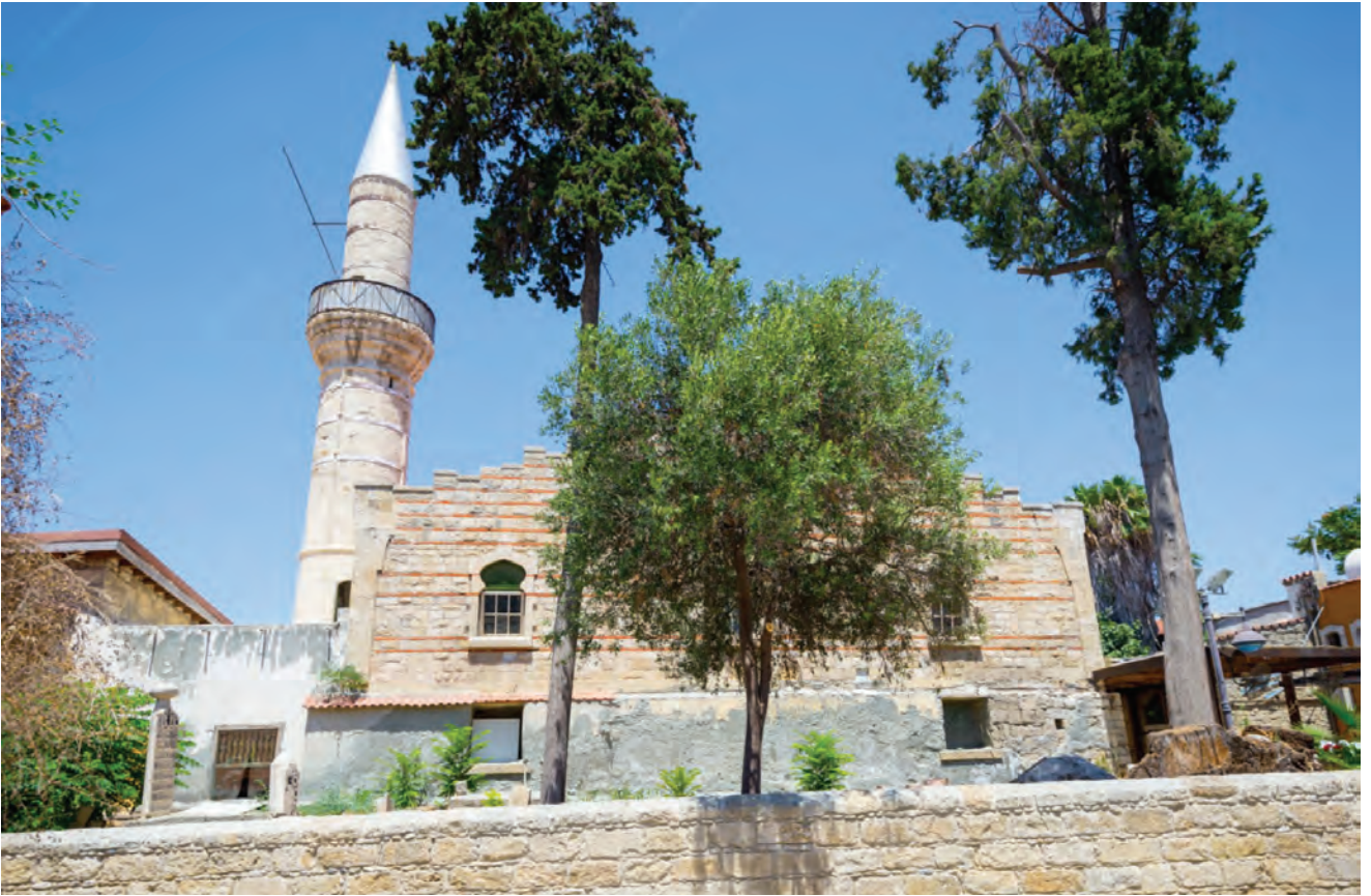
The Great Mosque of Limassol