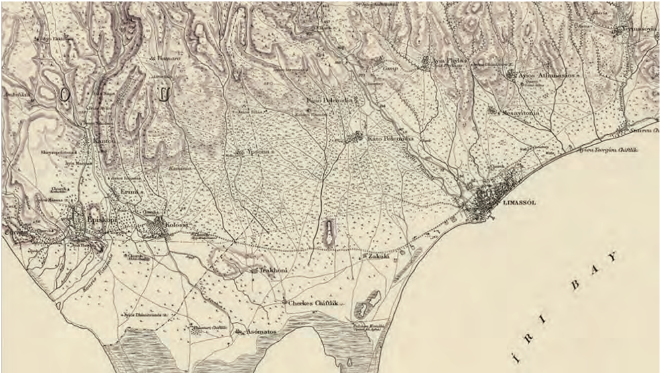
A small section from one of Kitchener's maps showing the Limassol area (Edinburgh University)

On his return to Cyprus, Kitchener picked up from where he'd left off. From each end of the baseline he'd constructed earlier, observations were made of clearly defined adjacent triangulation points. A network of triangles was constructed outward from the baseline and over time the whole island was covered with a series of 137 linked and angularly measured triangles.