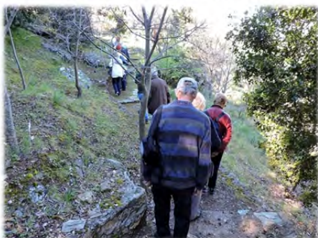
The ever-present Acropolis