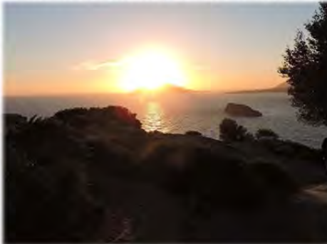
Kerameikos archeological site with guide Kiki